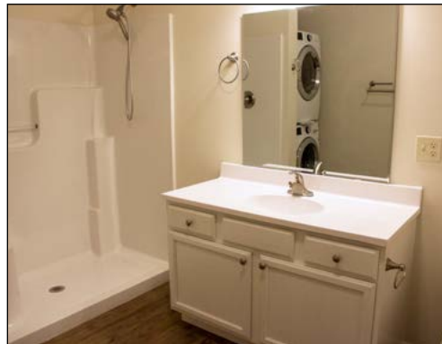
TOP: The commons area in the new Maple Valley Apartments provides a place for residents and guests to gather. Quite a few people visited the apartment complex during an open house Jan. 24. CENTER: This is a view of the kitchen area. The door frame to the far left (just visible) is to the bathroom; the open door looks into the hallway and into the apartment across the hallway. The door frame just visible on the right accesses the apartment's garage. BOTTOM: Each apartment has a walk-in shower, as well as its own washer and dryer (visible in the mirror).