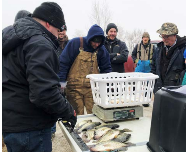
ABOVE: Anglers gather at the weigh-in.